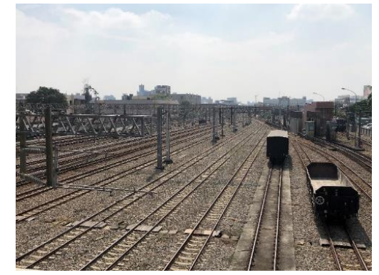
In the premises of the present Chiayi Station