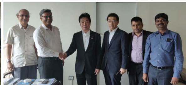
Signing Ceremony with CMRL Managing Director,